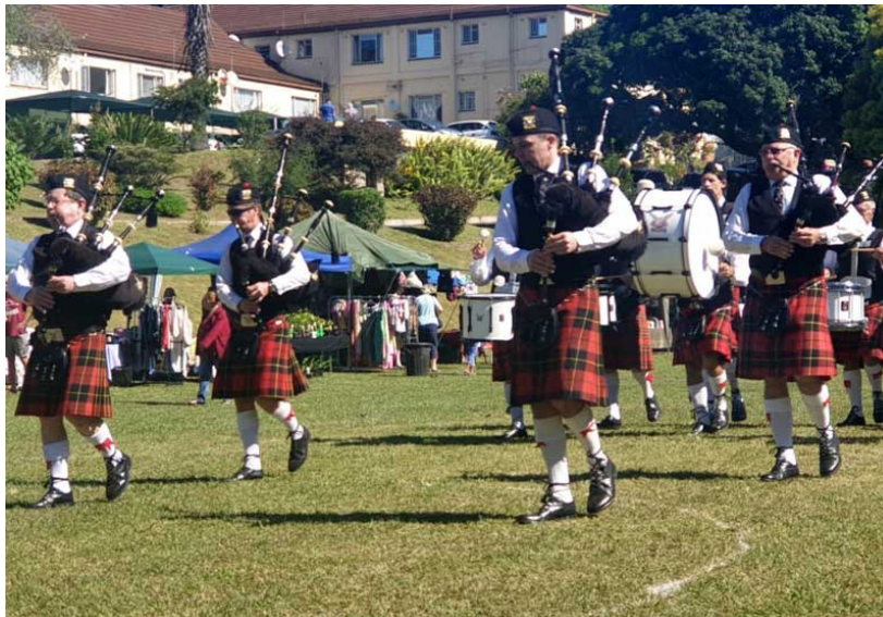
The Durban Regiment Pipe Band marching into the circle at the recent Flame Lily contest.