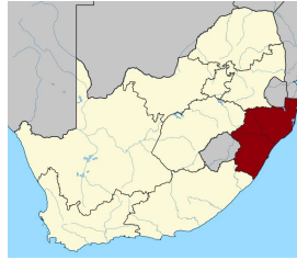
Map of South Africa showing KwaZulu Natal (in red).