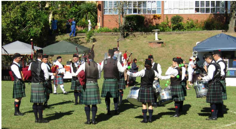
Durban Caledonian Society Pipe Band.

The KwaZulu Natal Piping and Drumming society decided to have a ‘mini contest’ two weeks before South Coast just to give the bands an opportunity to play their sets and be judged on them. As originally envisaged, it would be nothing big and probably not have any spectators apart from band members and some family members. While looking for a venue, the Flame Lily M.O.T.H.* Shellhole offered to host it at their premises at Flame Lily Park, Queensburgh, which incorporates the Shellhole [meeting premises/social club], a hall, a spots field and an ex-serviceman’s retirement village. The shellhole holds fêtes there and it was felt that by holding the contest on the same morning as a fête the bands would have a ready-made audience which would add to the contest experience. The first one was held three years ago and was rather low key. The third one was held on Saturday, April 13, 2019 and was a much bigger affair. This year there were nearly double the stalls at the fête and probably three times the audience that we had last year.