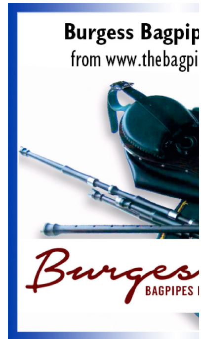
PHOTO OF THE DAY

Overall – 1. Durban Caledonian Society Pipe Band (Grade 2); 2. Durban Regiment Pipe Band; 3. Pietermaritzburg Caledonian Pipe Band.