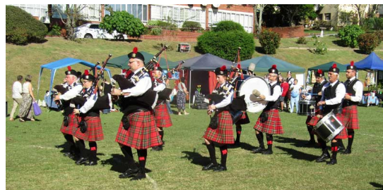
Pietermaritzburg Caledonian Pipe Band.

1. Durban Caledonian Society Pipe Band (Grade 2); 2. Durban Regiment Pipe Band; 3. Pietermaritzburg Caledonian Pipe Band